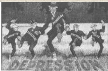
A collection of anti-prohibition cartoons from alcohol prohibition can also be found on Bot.

Bot runs 24/7, gathering and categorizing the latest news. No other site delivers breaking drug policy news faster!